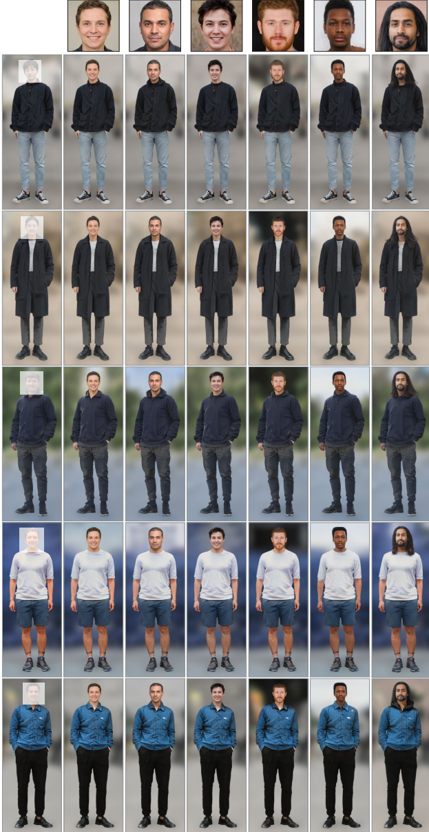
Figure 7. Face Body Montage. Given target faces ( top row ) generated by the pretrained FFHQ model and bodies ( leftmost column ) generated by our full-body human generator, we apply joint latent optimization to find compatible face and human latent codes that can be combined to produce coherent full-body humans. Notice how face and skin colors get synchronized, and zoom in to observe the (lack of) seams around face insets.

to allow for more flexibility during optimization and to reduce the risk of overfitting to artifacts from the source image (e.g., the body GAN’s face region, which lacks realistic high-frequency details) in a strategy similar to PULSE [24].