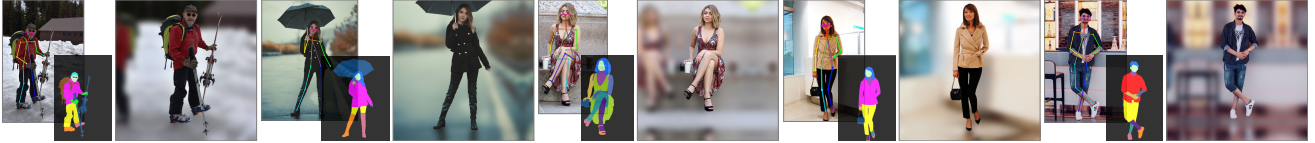
Figure 9. Full-body Human Dataset. We create a dataset from photographs of humans in the wild. The images are automatically preprocessed, aligned, and cropped to 1024 \times 1024 px resolution using the ground-truth segmentation masks and detected pose skeletons.

scale the humans based on their upper-body length and then evaluate the extent of the face region as defined by the segmentation mask. If the face length is smaller (larger) than a given minimum (maximum) value, we rescale so that the face length is equal to the minimum (maximum).