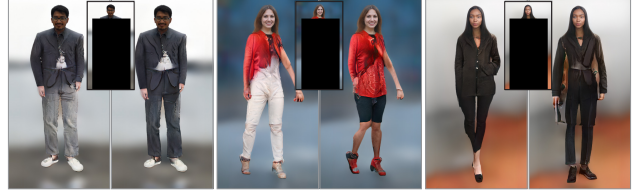
Figure 11. Body Generation with CoModGAN [33]. We show results generated by CoModGAN trained to fill a rectangular hole covering the body in a given image. Inputs with holes are shown in insets. We generate several results per input and show the best looking two here. Please refer to Fig. 6 for our results on the same input faces. We observe that CoModGAN creates seamless content, but worse visual quality compared to ours.

Dataset Bias and Societal Impact. Both DeepFashion and our proprietary dataset contain biases. DeepFashion contains a limited number of unique identities. The same models appear in multiple images. An overwhelming majority of the images are female (around 9:1) and the range of age, ethnicity and body shape does not represent the real human population. As a result, models trained on it can only