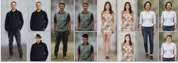
Figure 10. Face Refinement Comparison with CoModGAN [33]. Given generated humans ( left ), InsetGAN improves the face quality ( top right ), producing more convincing results than CoModGAN ( bottom right ). CoModGAN results are generated by defining rectangular holes around the face regions.

User Study. We performed a user study to better evaluate the perceptual quality of our method. We aggregated 500 generated humans from our full-body generator and 500 random training images. We then applied either our joint optimization method or CoModGAN to replace the face regions in the generated samples. We showed several sets of image pairs to volunteer participants on Amazon Mechanical Turk and asked them to pick “in which of the two images the person looks more plausible and real”. Per image pair, 5 votes were collected and aggregated towards the majority votes. The study shows that in 12.4% of image pairs, users prefer our unrefined results over the training images when given only 1 second to look at each image. This shows that our results get the basic human proportion and pose right, being able to confuse people about being real. In 98% of cases, users prefer our joint optimization results over the unrefined images. In contrast, only 7% of the CoModGAN samples were picked over the unrefined images, which is consistent with our observation from Fig. 10.