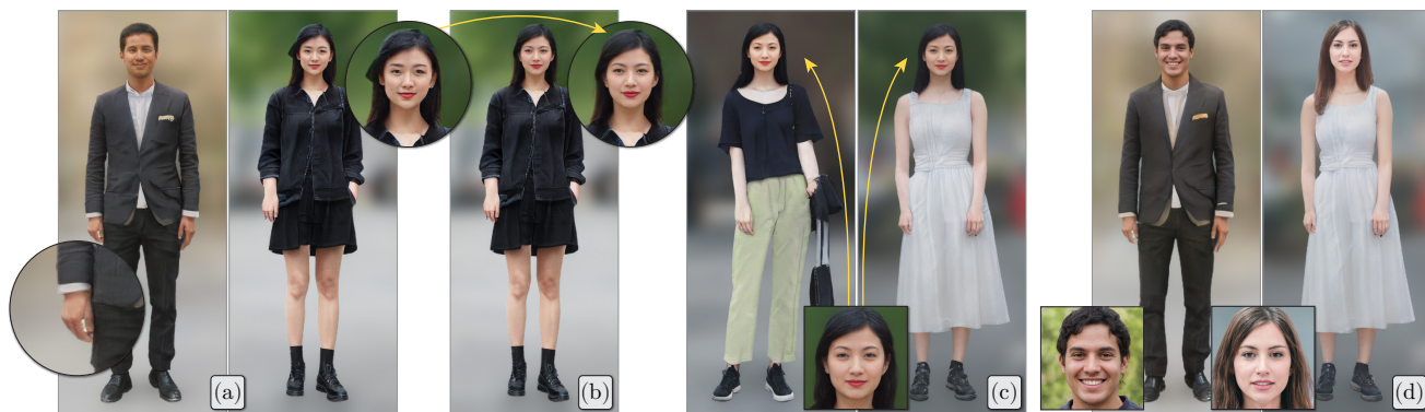
Figure 1. InsetGAN applications. Our full-body human generator is able to generate reasonable bodies at state-of-the-art resolution ( 1024 \times 1024 px) (a). However, some artifacts appear in the synthesized results, most visibly in extremities and faces. We make use of a second, specialized generator to seamlessly improve the face region (b). We can also use a given face as an input for unconditional generation of bodies (c). Furthermore, we can select both specific faces and bodies and compose them in a seamlessly merged output (d).

anna.fruehstueck@kaust.edu.sa, {krishsin, elishe}@adobe.com, {niloym, pwonka}@gmail.com, jlu@adobe.com