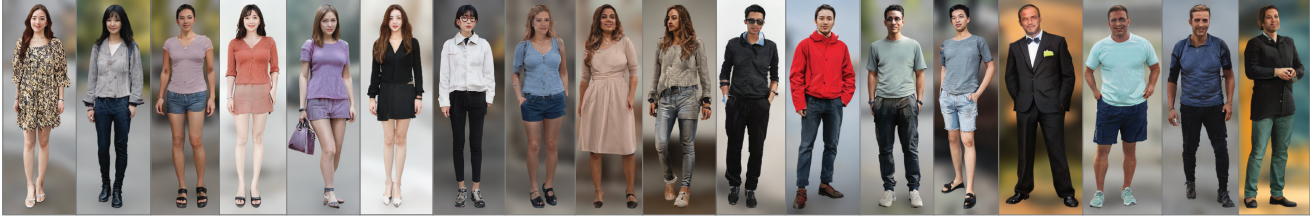
Figure 3. Unconditional generation results. Examples are created using our adaptive truncation approach (described in the supplementary material) and are cropped horizontally. At first glance, the results look realistic, but face regions show noticeable artifacts (please zoom).

Image Outpainting refers to image completion problems where the missing pixels are not surrounded by available pixels. Recent papers build on the ideas to use generative adversarial networks [29] and the explicit modeling of structure [19, 34]. Though these two papers specialize in human bodies, we find that the GAN architecture CoModGAN [33] has even more impressive results for image outpainting (see the comparison in Section 5).