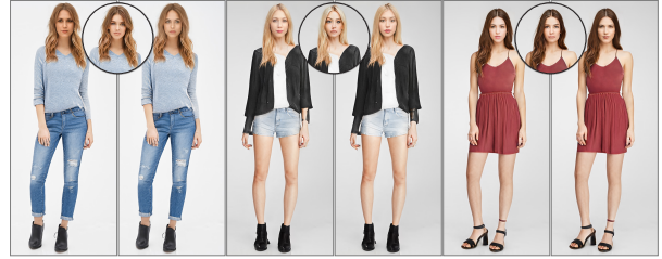
Figure 8. Multimodal Face Improvement. To improve humans generated by a full-body model trained on DeepFashion, we use the pretrained FFHQ model to synthesize a variety of seamlessly merged result faces that all look compatible with the input body.

One challenge in the joint optimization of w_A and w_B is that the boundary condition \Omega depends on the variable w_A . We address this by alternately optimizing for w_A and w_B , and reevaluating the boundary after each update of w_A . We