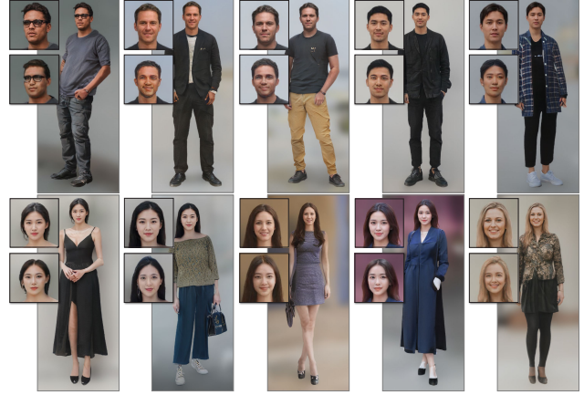
Figure 5. Face Refinement. Given generated humans, we use a dedicated face model trained on the same dataset to improve the quality of the face region. We jointly optimize both the face and the human latent codes so that the two generators coordinate with each other to produce coherent results. The two inset face crops show the initial face generated by the body GAN ( bottom ) and the final face improved by dedicated face GAN ( top ).

where \mathcal{E}_x(I) is the border region of I of width x pixels.