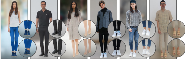
Figure 4. Two Insets. These results are improved using a dedicated shoe generator trained on shoe crops from our full-body humans, and also using our face generator. All three generators (full-body canvas and two insets) are jointly optimized to produce a seamless coherent output. The circular closeups show the shoes before ( top ) and after ( bottom ) improvement (please zoom).

pixels as \mathcal{B}(I_A) . The problem of inserting a separately-generated part I_B into the canvas I_A is equivalent to finding a latent code pair (\mathbf{w}_A, \mathbf{w}_B) such that the respective images I_A and I_B can be combined without noticeable seams in the boundary regions of \mathcal{B}(I_A) and I_B . To generate the final result, we directly replace the original pixels inside the bounding box \mathcal{B}(I_A) with the generated pixels from I_B ,